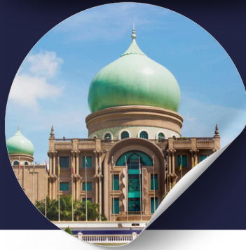
High-level government officials, decision-makers in the public and private sectors