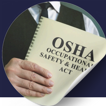
International and regional OSH NGOs and Tourism organizations