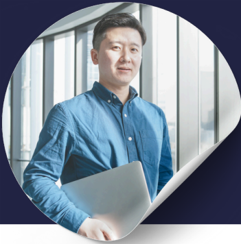
Investors & Business Owners (employers)