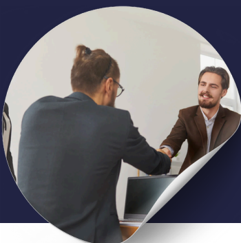
Government and Public OSH organizations