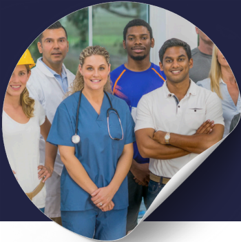
OSH Practitioners and Professionals