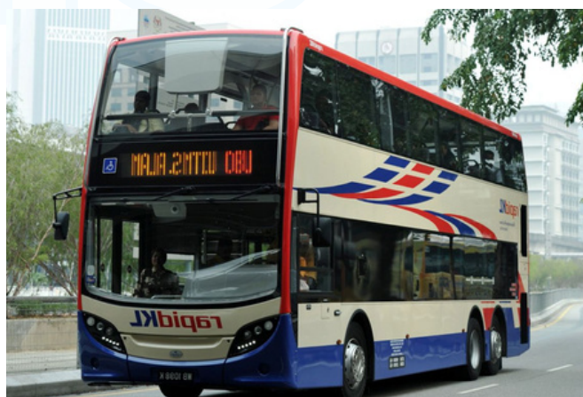
BUSES; RAPIDKL, HOP-ON HOP-OFF & GOKL