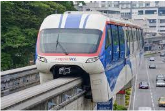
TRAINS; MRT, LRT, KTM & MONORAIL

Kuala Lumpur City Centre (KLCC) offers a well-connected and efficient transportation system, providing various options from public transport, rental vehicles and self-own vehicles. The integration of transportation options makes it relatively easy to move around and explore Kuala Lumpur City Centre efficiently. The modern transportation hubs provides a convenient travel options within the country as well.