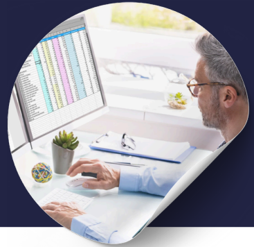
Chief Executive Officers (CEOs), human resources, finance, procurement etc