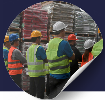
Trade unions, workers and their representatives