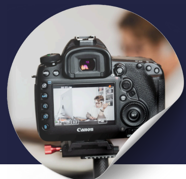
Media practitioners – digital, electronic and printed.