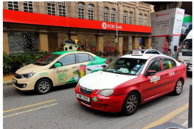
CARS; TAXI, GRAB & RENTAL CAR