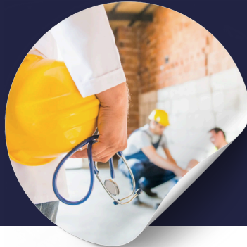
Occupational medicine, inspectors, trainers, auditors etc